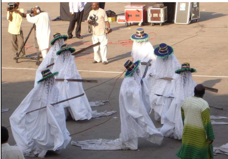
EYO MASQUERADE DANCE IN LAGOS